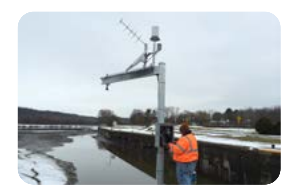
Xylem representative installing a HydroMet monitoring solution

Contact your local sales representative or visit YSI.com and SonTek.com for detailed sensor specifications, accessory options, and more. We also offer full installation and training services.