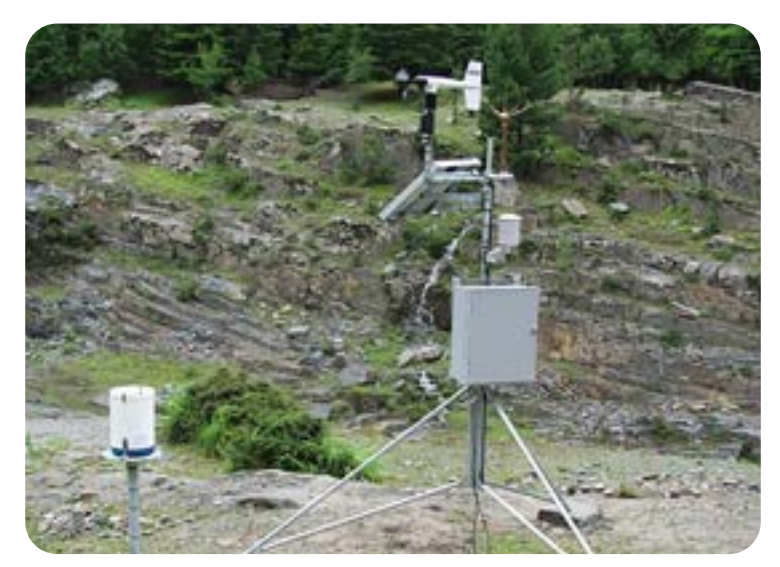
Turn-Key monitoring station containing a YSI Data Logger, Rain Gauge and other meteorological sensors.