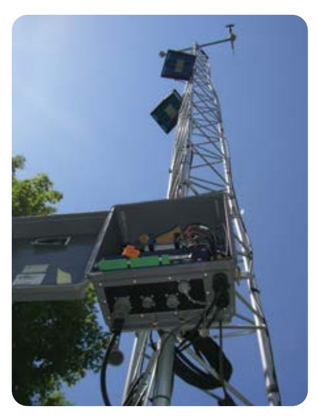
Monitoring tower containing a YSI Data Logger, and meteorological sensors

Xylem portable or permanent HydroMet monitoring systems are custom designed to meet your specifications. These versatile, advanced systems meet almost any compliance criteria and protect public safety. Typical measurements include water level, flow, velocity, water quality, relative humidity and air temperature, precipitation, wind speed, and solar radiation.