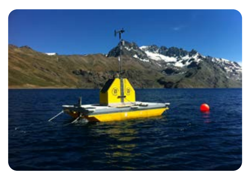
Monitoring Buoy containing a YSI Sonde, and meteorological sensors.