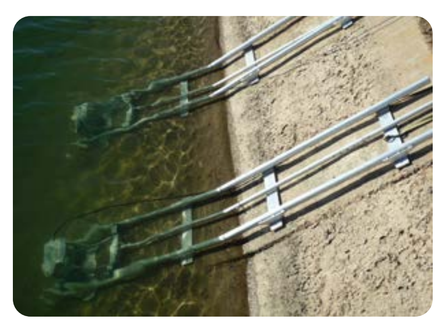
Example of a typical SonTek-SL1500 concrete lined canal installation as part of a HydroMet station.