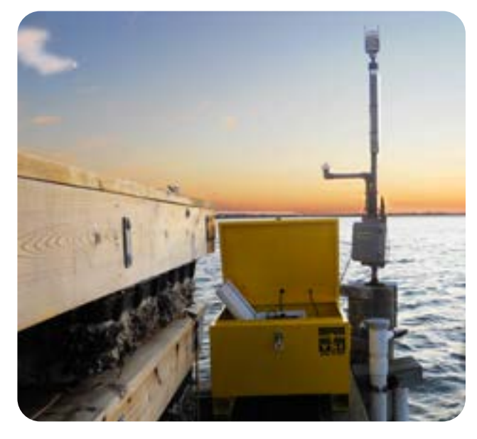
Portable aluminum chest monitoring system containing a YSI Bubbler, Sonde, Data Logger, and meteorological sensors.

Buoy based solutions offer quick deployment, from the shoreline or small boat. Through-hull penetration for monitoring equipment makes routine servicing simple, fast, and secure.