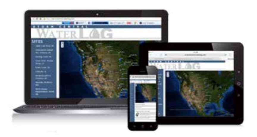
Storm Central Cloud-hosted Data Solution shown on multiple platforms

Our Storm Central cloud-hosted data solution collects data from the Storm data logger in real-time. Communicate through devices such as cell modems, and GOES satellite transmitter. In addition, the Storm Central service is able to connect to your existing GOES stations, providing an immediate view of your data.