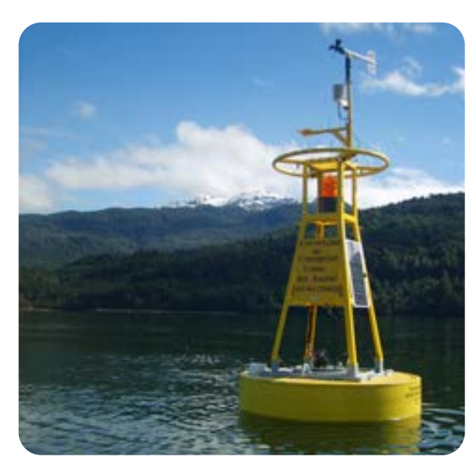
Monitoring Bouy containing meteorological sensors.