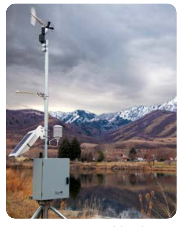
Monitoring station containing a YSI Storm 3 Data Logger, and meteorological sensors.

Xylem brand monitoring and gauging instruments are renowned for their robustness, ease of use and practicality.